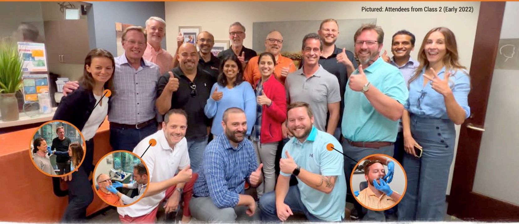
Pictured: Attendees from Class 2 (Early 2022)